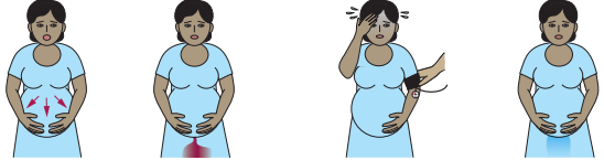
Preterm labor (PTL) Antenatal hemorrhage Severe pre-eclampsia Preterm pre-labor rupture of membranes (PPROM)

PROBABLE DAY OF CONCEPTION FIRST DAY OF LAST MENSTRUAL PERIOD